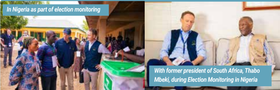
With former president of South Africa, Thabo Mbeki, during Election Monitoring in Nigeria