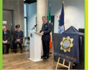
At the opening of the Public Transport Hub with Garda Commissioner Drew Harris.

In May, I attended the opening of a dedicated Garda Public Transport Hub at Heuston Station. The Hub will allow Gardai based at the hub to have oversight of all public transport networks including trains, buses and trams. The opening of the Transport Hub, which has a staff of 100 comprised of both Garda members and Garda staff, follows on from an ongoing campaign from Fianna Fáil's Dublin TDs and Senators who have been calling for the hub along with a dedicated public transport policing unit.