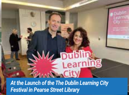
At the Launch of the The Dublin Learning City Festival in Pearse Street Library