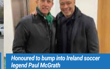
Honoured to bump into Ireland soccer legend Paul McGrath