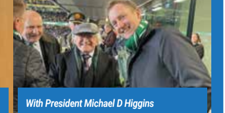
With President Michael D Higgins